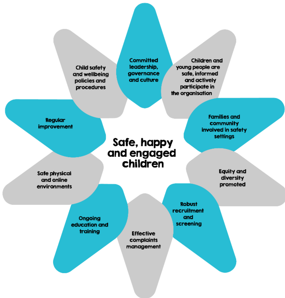
Wheel of Child Safety